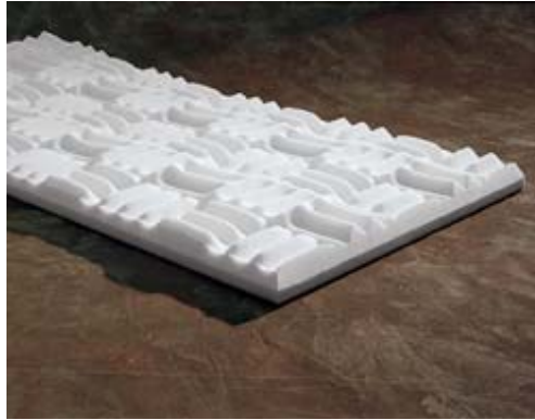
Sonex One Panels