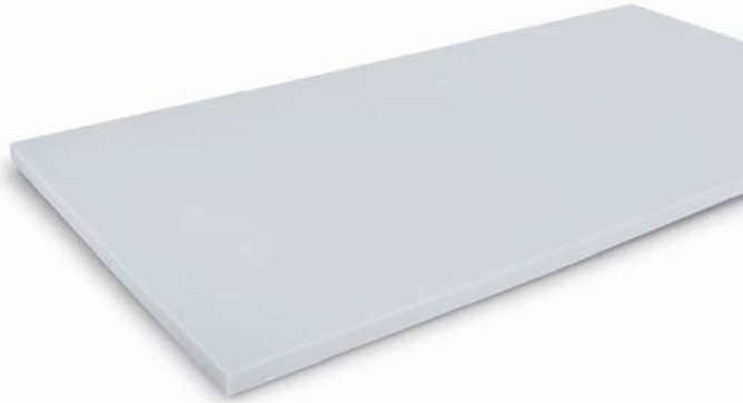
Sonex Flat Panels