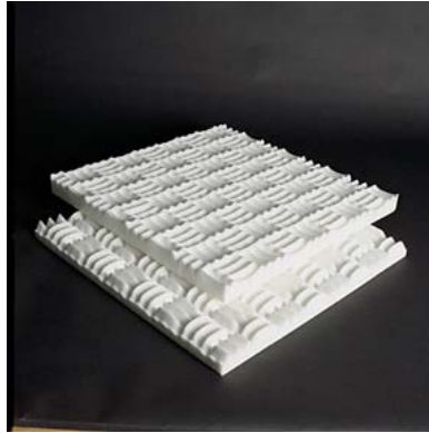
Sonex Classic Panels