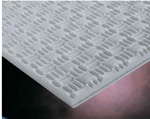
Prospec Composite Panels*

**Please call for painted or Hypalon coated pricing. 800.801.9378