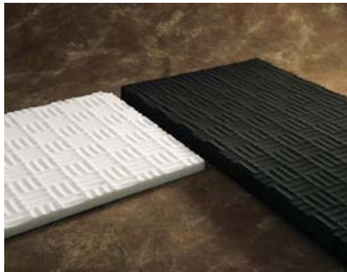
Sonex Valueline Panels

**Please call for painted or Hypalon coated pricing. 800.801.9378